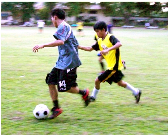
A player from the CVM Vipers protecting the ball from the opponent, hoping to make it to the goal.